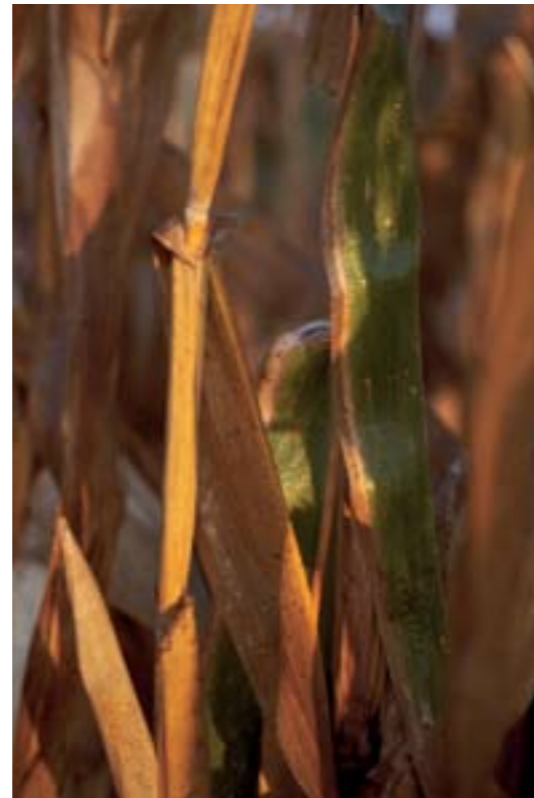
PHOTO 1 Dried stalks. PHOTO 2 Lines of stems. PHOTO 3 Poison ivy twines up a telephone pole. PHOTO 4 Stalks of field corn. PHOTO 5 Dried stems.