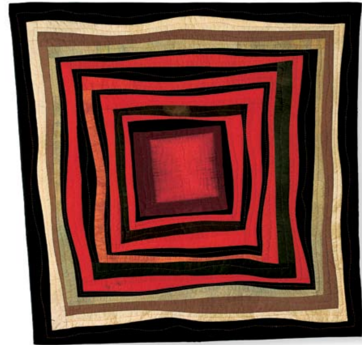
Linear Study #1 , ©1993. 24" × 24". 100 percent cotton fabric hand-dyed by Nancy Crow with center square resist-dyed by Lunn Fabrics. Fabrics cut into directly and machine- pieced by Nancy Crow. Hand-quilted by Marla Hattabaugh with pattern denoted by Nancy Crow.

In Linear Studies I wanted to draw lines with intent. I wanted to draw with a sharp blade and create an authentic edge along narrow widths of fabric. I am still learning.