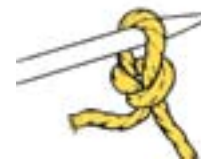
STEP 2. Slip Knot